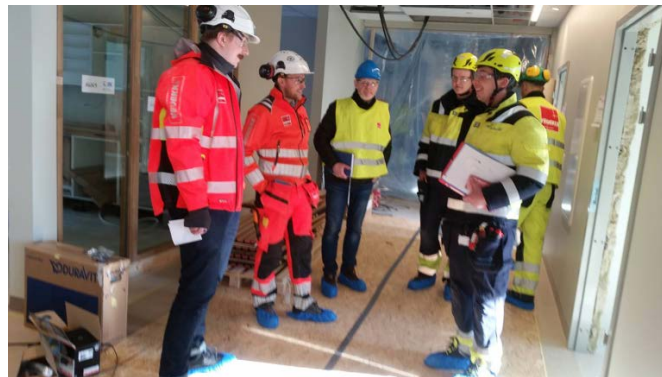
From team-leader walk case 1.

In response to this situation, the team-leader walk, or just 'walk' (in Norwegian 'Basrunde') is introduced in order to help the team-leader meeting to see and plan three weeks ahead. One aspect separating this approach to the team-leader walk from similar planning practises is its explicit relation to the TAKT organisation of the building process. With TAKT the production front and horizon three weeks ahead is structured in a specific way in terms of systematic movement in time and space through the building, divided in zones.