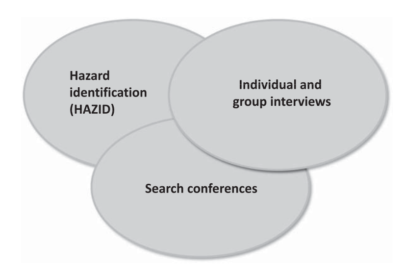
Figure 2. Participatory activities for the identification, evaluation and development of collision preventive safety barriers.