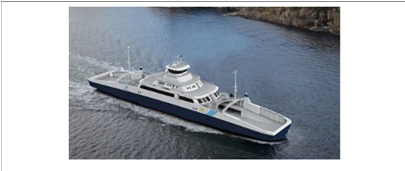
FIGURE 1 | E-ferry.