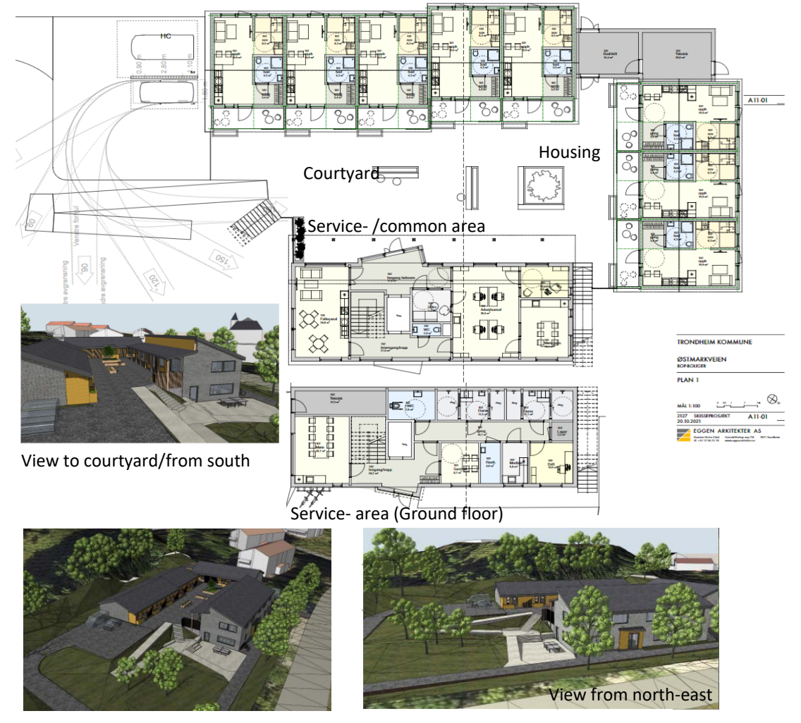
Figure 2. The scheme design dated 20th October 2021. Drawings: Eggen Architects as.

Physical design can affect people's activity, choices, and not least security and wellbeing (Thaler & Sunstein, 2008; Ulrich et. al 2018).